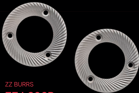
ZZ BURRS ZZ k206P

FLAVOR PROFILE: Well-rounded cups with a complex structure of flavours, nice acidity, fruity notes, a soft, velvety texture, and light-medium body.